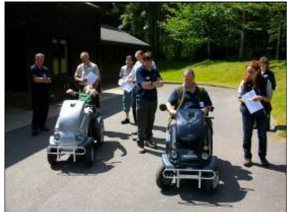
Staff training, Haldon Forest Park

We have also been working with our website designers on the new Countryside Mobility site which is now live...read on below for more details.