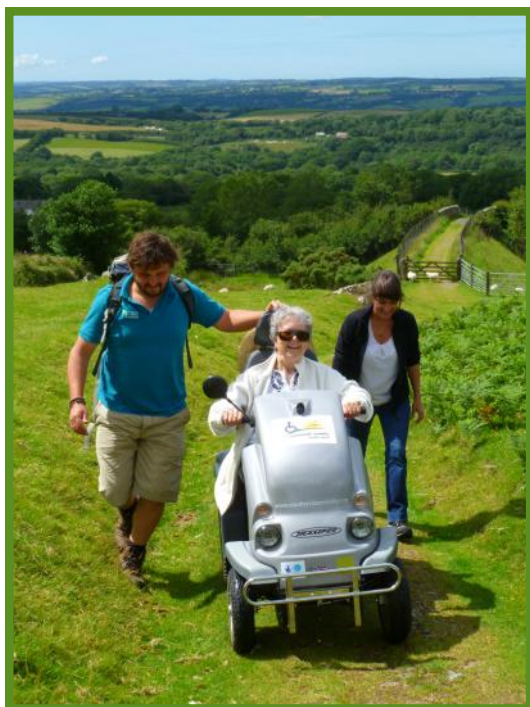
Sourton Trampler Trip, Dartmoor

Two new Wheelyboat hire locations have also been confirmed in the last few months and these will become available for hire in spring 2013 at Wareham Boat Hire (Wareham, Dorset) and at Maunsel Lock Canal Centre on the Bridgwater and Taunton Canal (North Newton, Somerset).