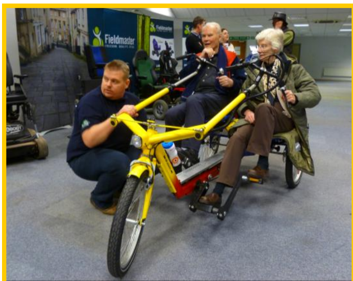
Off-road mobility equipment event

Countryside Mobility has gone from strength to strength over the last six months with 25 sites now participating in the scheme and more joining later this summer. More than 700 (seven hundred) people have now used our Trampers and Wheelyboats for over 1700 hours in total, and early indications are that 2012 is going to be our best year yet with equipment bookings and membership applications on the rise.