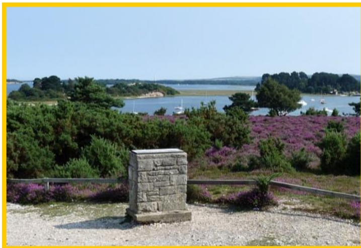
RSPB Arne and Poole Harbour

Biketrail Cycle Hire , situated on the Tarka Trail at Fremington Quay (near Barnstaple), is the latest site to take delivery of a Trampler. The Trampler is being partly funded by the North Devon Area of Outstanding Natural Beauty (AONB) as part of the 'Life's Journey' project. Situated just down the road in Bude, The Weir Café received their Trampler a few days before, which can be used along the Bude Canal and other circular routes around Whalesborough Farm.