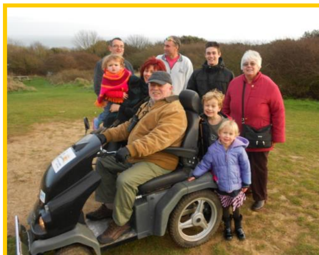
The Harris Family at Durlston Country Park

http://www.facebook.com/CountrysideMobility